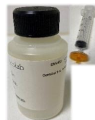
HCL Preserved Filter into for Ferrous Iron (Fell)