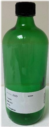
1L Glass *

Organics including TPH, EPH, PAH, PCB, SVOC, Pesticides, Mineral Oil